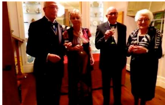
The Master and his wife, the Upper Warden and the Under Warden standing in the reception line.